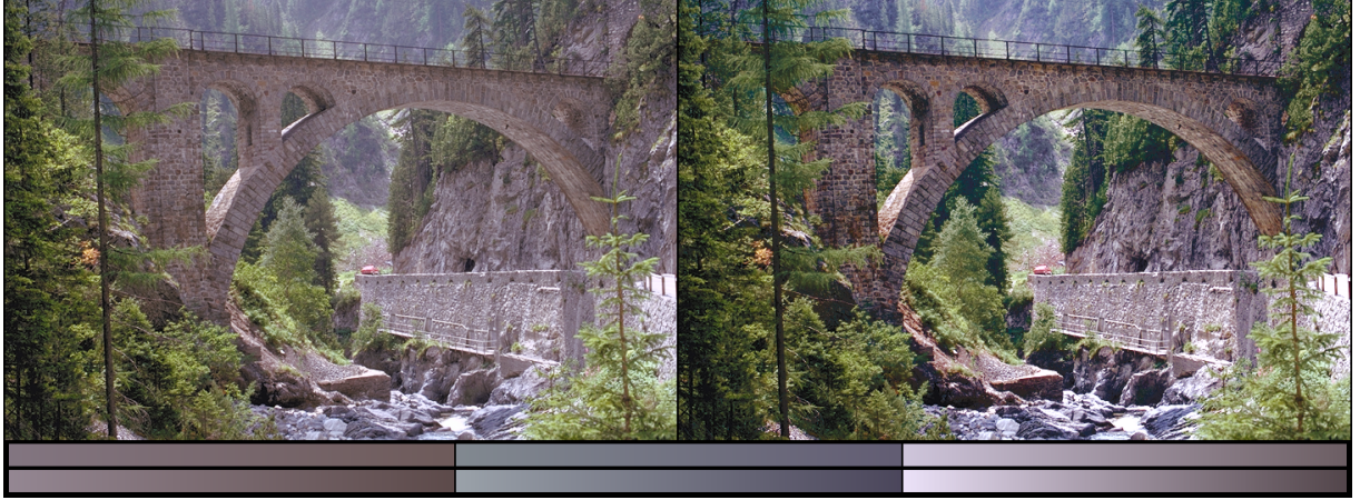
Figure 3: Contrast enhancement. The source color gradients (top row) are mapped to the target color gradient (bottom row).

influence of each color gradient mapping, we use its perceptual similarity map S_i . Its extent can be adjusted by the user through the combined scaling factor \delta_i = \omega \sigma_i . At each pixel, we evaluate the similarity S_i between the pixel color \vec{P}_0 and the closest color \vec{Q}_i present in the source color gradient \vec{G}_i :