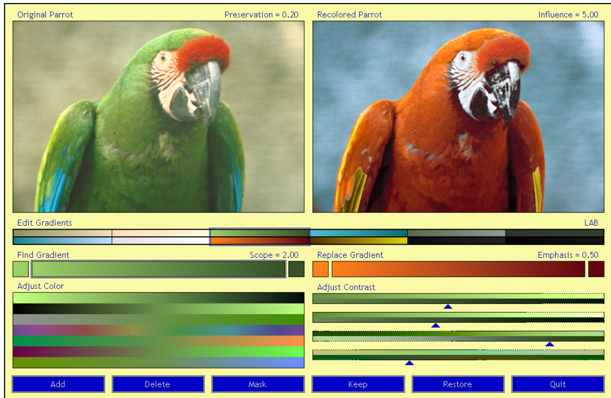
Figure 2: User interface for color search and replace.

color variation. Furthermore, these operations can be constrained to act on just luminance and leave hue unaltered. The user can easily change one color gradient property without affecting another, as each parameter controls a different color editing operation. A color shift need not entail an overall contrast change while a contrast adjustment need not entail an overall color change. Moreover, the hue and luminance variations can produce subtle color effects that cause neither an overall color shift nor an overall contrast change.